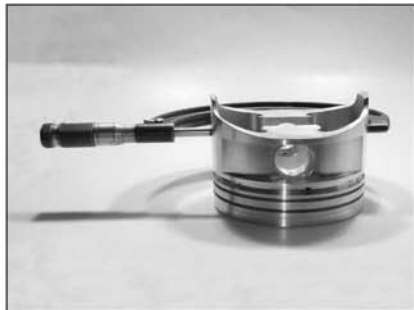
SET CLEARANCE AT BOTTOM SILL OF SIDE RELIEF